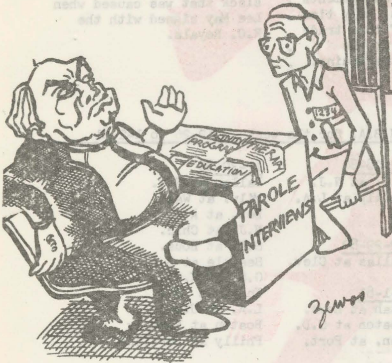
"Your rehabilitation went so well, we've decided to keep you as a model for others."