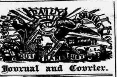
Journal and Courier.

NEW HAVEN, CONN. FRIDAY MORNING, FEBRUARY 7, 1891. CENTS: ONE WEEK, 15 CENTS; SIX MONTHS, $1.00.